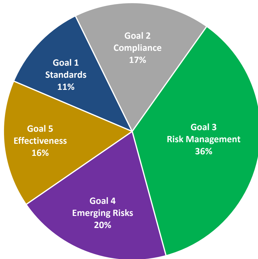
NERC Resource Allocation to Strategic Goal Areas