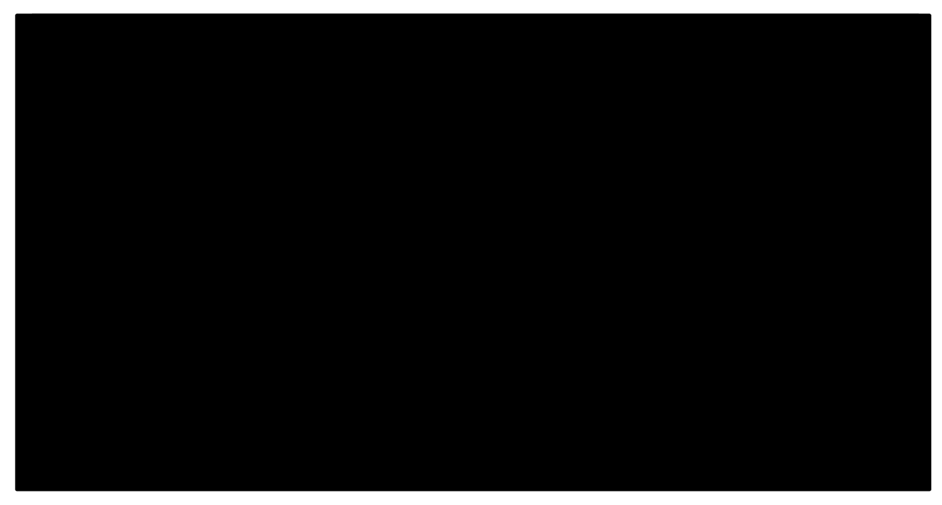
Figure 2-3 EMS vendors

into a critical supply chain within the system development lifecycle of one of the core vendor's in this category, the result could be significant to the reliability and security of the BES.